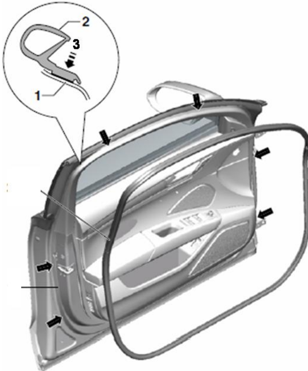
Figure 4. Apply force to seal.