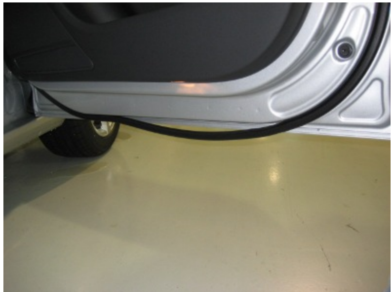
Figure 1. The outer door seal, partially detached.

The outer door seals have become partially detached.