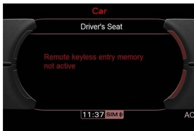
Figure 1. MMI message: “ Remote keyless entry memory not active” .

The seat memory does not work. The MMI displays that the memory function is not active (Figure 1. - Screen capture is an English translation and contents may not exactly match vehicle in service.)