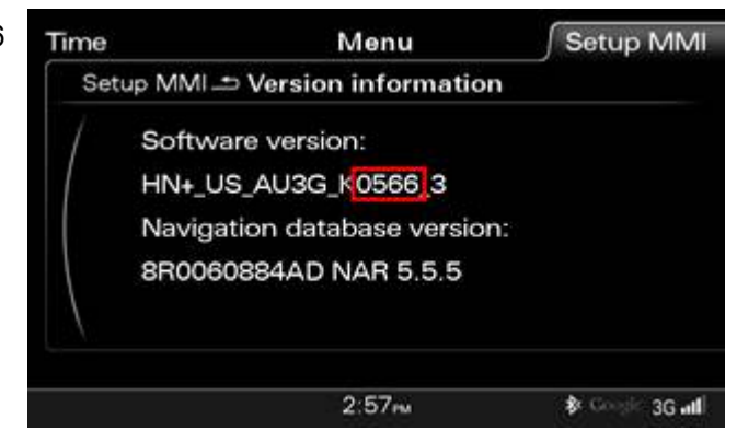
Figure 2. Location of MMI software level.

The vehicle has MMI software 0566 installed (Figure 2). This can be located under Menu >> Setup MMI >> Version information.