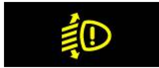
Figure 1. The dynamic headlight range control warning light.