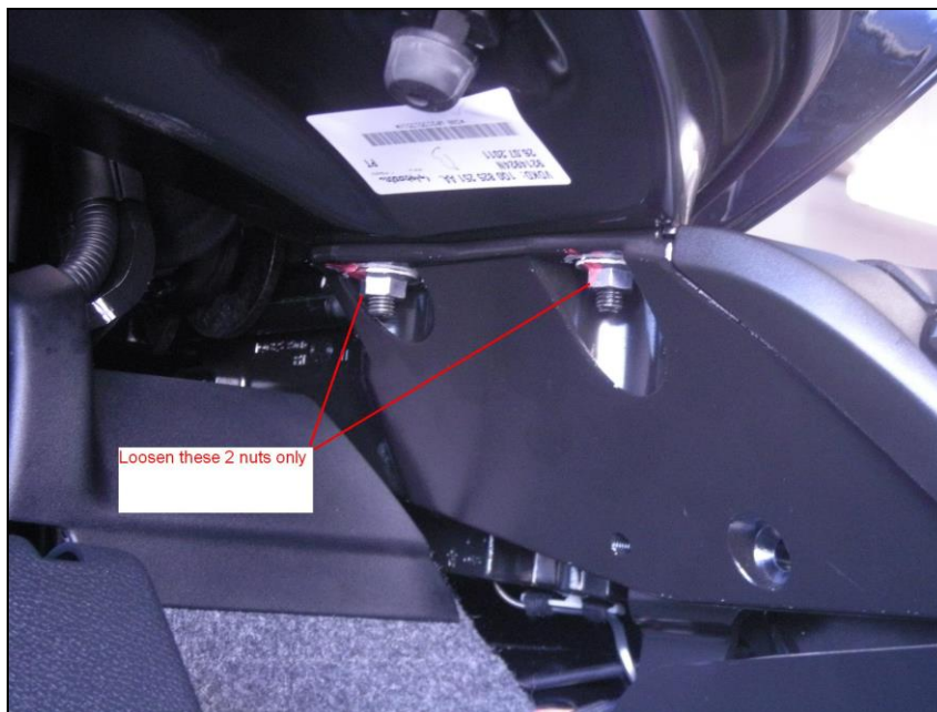
Figure 3: Lock mechanism mounting nuts