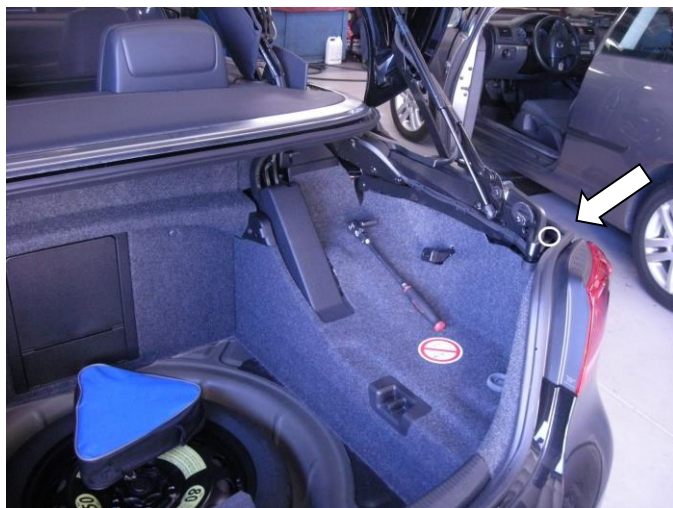
Figure 1: Overview of location on vehicle

To repair, open the trunk to access the underside of the parcel shelf. Remove the guide bushing if it is damaged. Loosen the 2 lock mechanism mounting nuts shown in figure 3 below on the underside of the parcel shelf (be sure to only loosen these 2 nuts due to pretension on the lock assembly). Adjust the locking mechanism so that the rear alignment guide pin is centered in the guide bushing hole. Resecure the 2 mounting nuts to 22NM. Close the trunk and cycle the top to check functionality. If the guide bushing was found to be damaged, replace with part number 1Q0898162A (see ETKA for latest supersession).