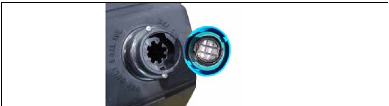
Figure 2 - New DEF Reservoir Cap