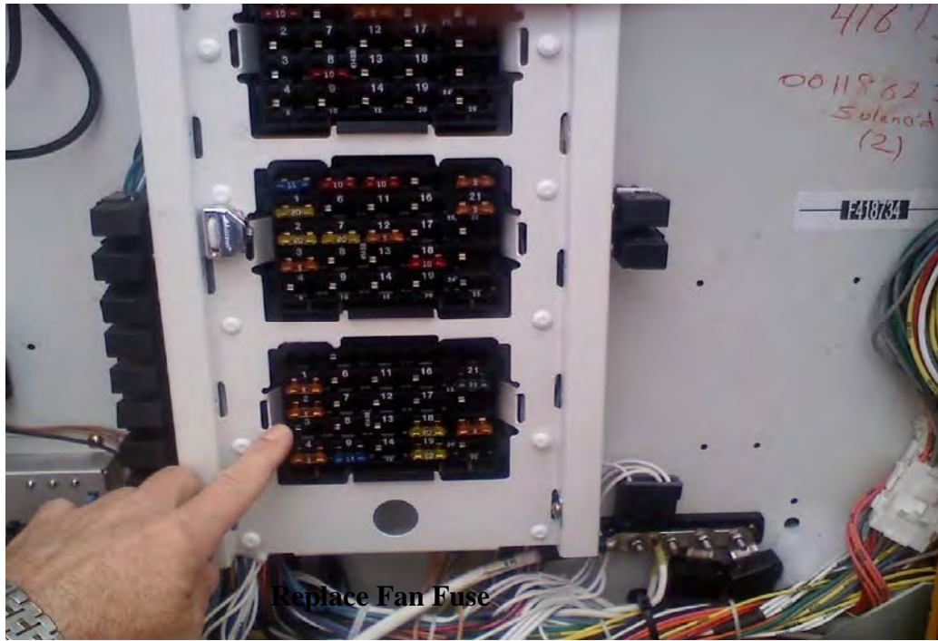
Replace Fan Fuse