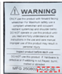
DATE OF MANUFACTURER AUG-25 OR SEP-25