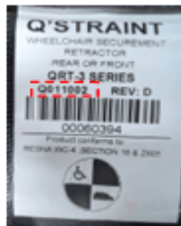
PART NUMBER Q011002