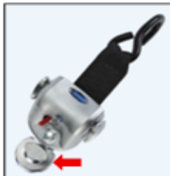
WITH SLIDE-N-CLICK QRT-360 SERIES