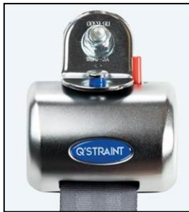
QRT MAX NO KNOBS