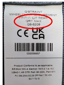
PART NUMBER Q8-6209