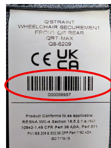
LOT NUMBER 58957