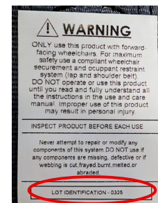
LOT IDENTIFICATION 0325

ONLY PROCEED IF THE RETRACTOR MATCHES THE PHOTOS ABOVE