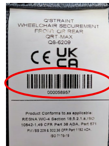
LOT NUMBER 58957