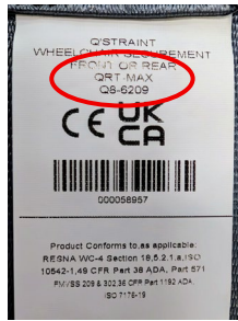
PART NUMBER Q8-6209