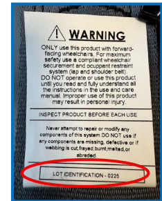
LOT IDENTIFICATION 0225

ONLY PROCEED IF THE RETRACTOR MATCHES THE PHOTOS ABOVE