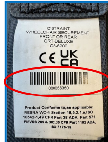
LOT NUMBER 58350