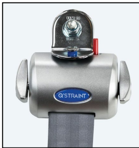
QRT DELUXE TWO (2) KNOBS