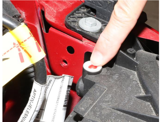
Figure 2 – Adjustment Cap