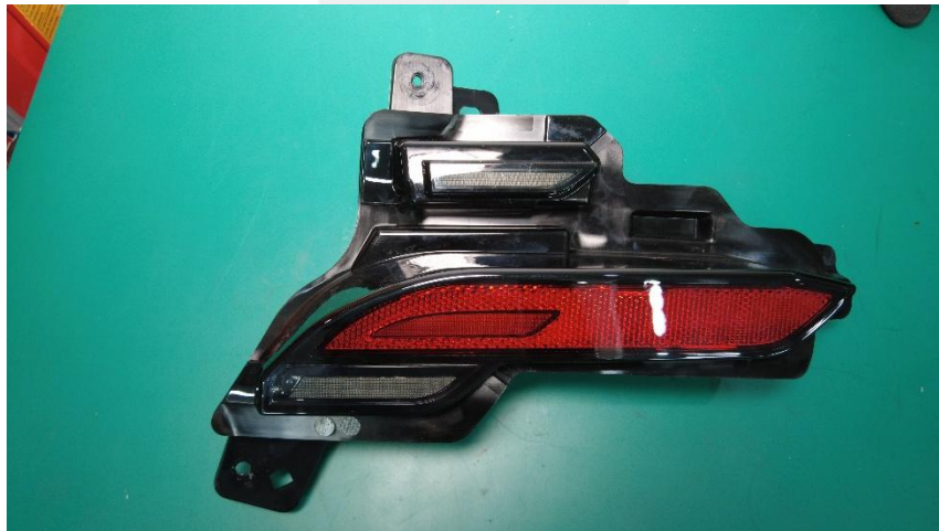
Figure 2 – LH shown; RH similar