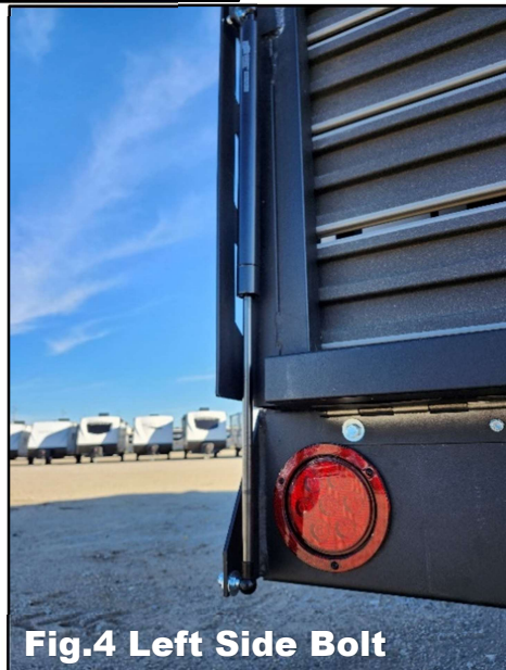
Fig.4 Left Side Bolt