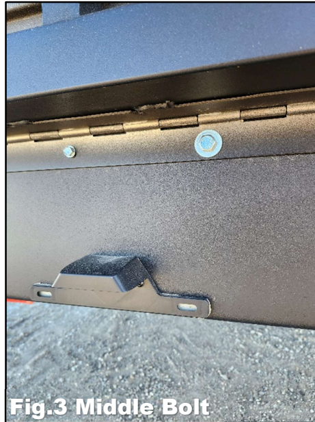
Fig.3 Middle Bolt