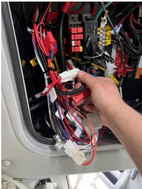
LOCATION OF HARNESS: