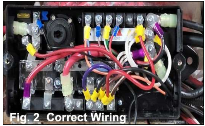
Fig. 2 Correct Wiring