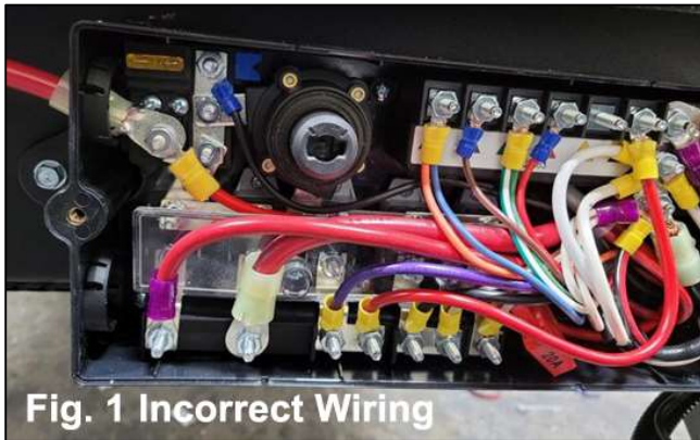
Fig. 1 Incorrect Wiring