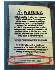
LOT IDENTIFICATION 0225

ONLY PROCEED IF THE RETRACTOR MATCHES THE PHOTOS ABOVE