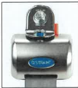
QRT MAX NO KNOBS