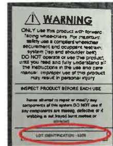
LOT IDENTIFICATION 0325

ONLY PROCEED IF THE RETRACTOR MATCHES THE PHOTOS ABOVE