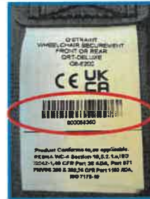
LOT NUMBER 58350