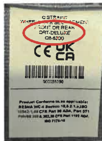
PART NUMBER Q8-6200