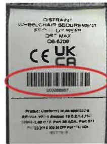
LOT NUMBER 58957