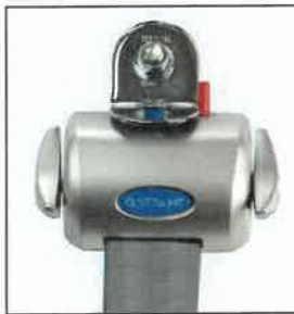
QRT DELUXE TWO (2) KNOBS