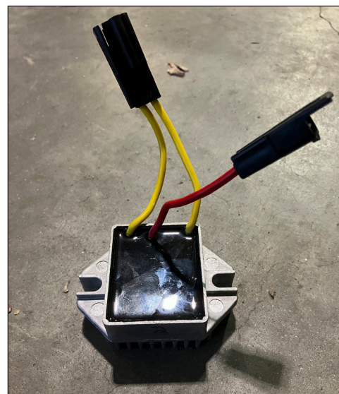
Figure 3 — Connector