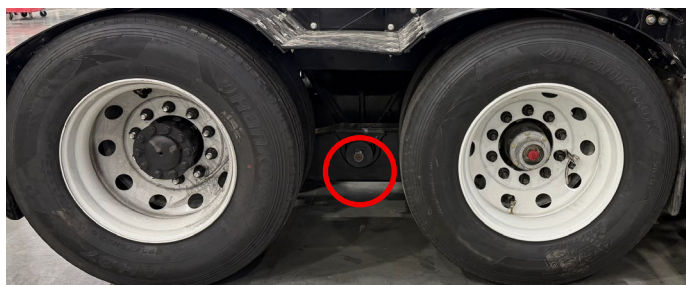
Trunnion Shear Nut Location Example 1