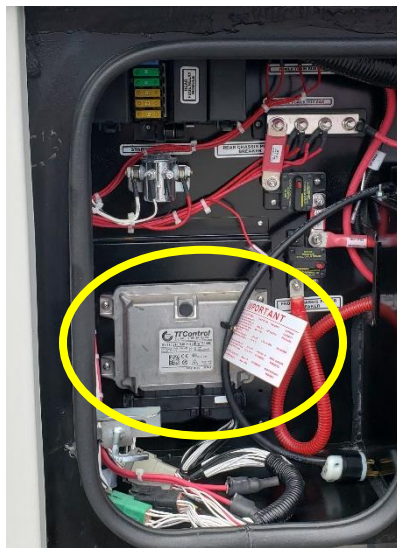
Other brand Chassis Controllers, no repair needed.