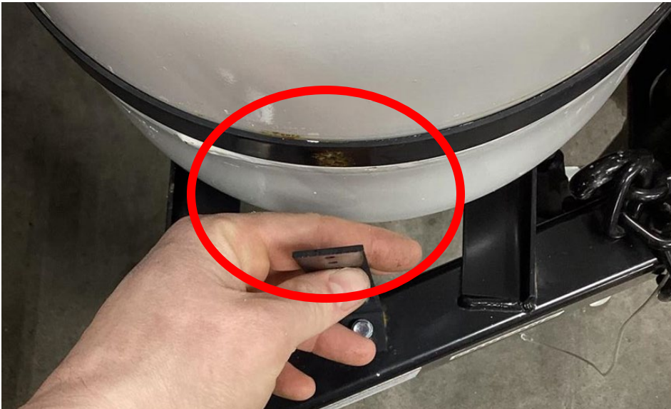
FIGURE 1 – WELD CRACKING/BREAK