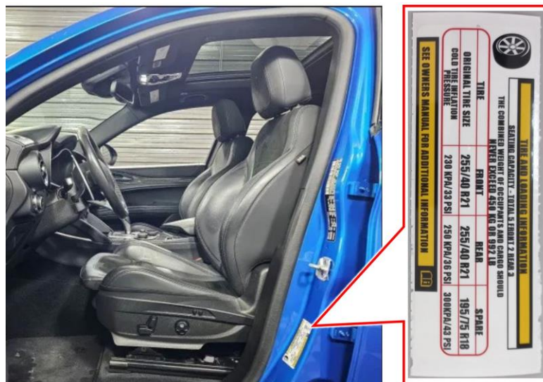
Figure 2 – Tire Placard Label Location