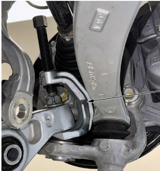
BALL JOINT SEPARATOR P/N 07-J-43631