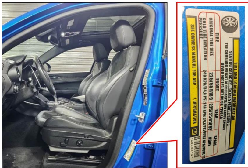
Figure 2 – Tire Placard Label Location