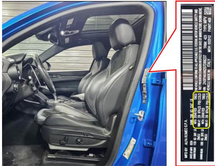
Figure 5 – Manufacturer Label Location

11. Locate the manufacturer label on the vehicle driver side B-pillar (Figure 5).