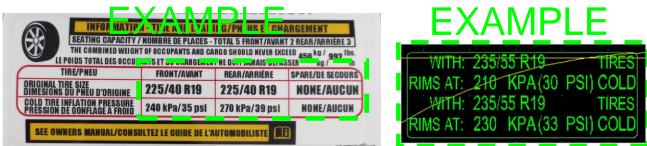
Figure 3 – Verify Labels are Correct for Vehicle

2. Verify the NEW labels are correct for the vehicle (Figure 3).