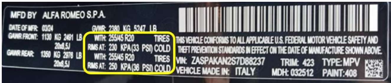
Figure 3 – Manufacturer Overlay Label Application Area