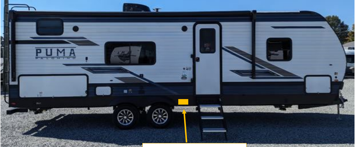
FIGURE 1 – DOOR SIDE

Photo(s) Required: YES, POST REMEDY Prior Authorization Required: YES Part(s) Kit Number: F100604835 Part(s) Return: N/A