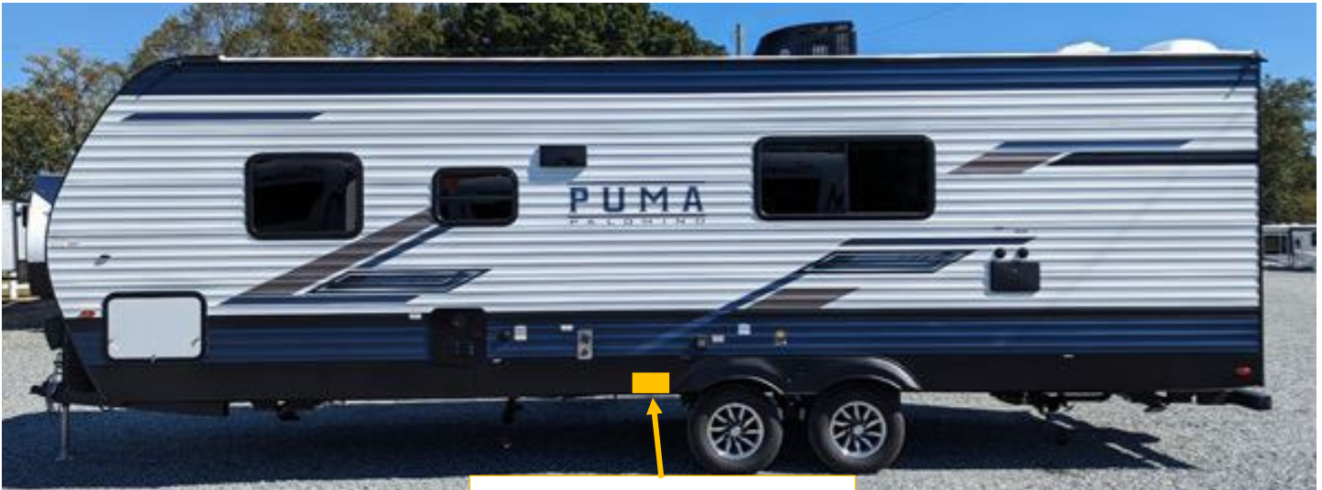
FIGURE 2 – OFF DOOR SIDE