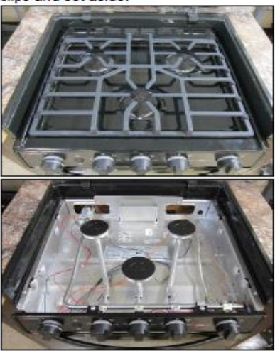
Locate the red and black wires that connect to the coach wiring (Coach wiring color may vary). Cut this wire directly behind the connector using a pair of electrical cutters.