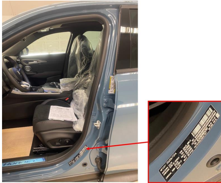
Figure 1 – Locate Manufacturer Label Location