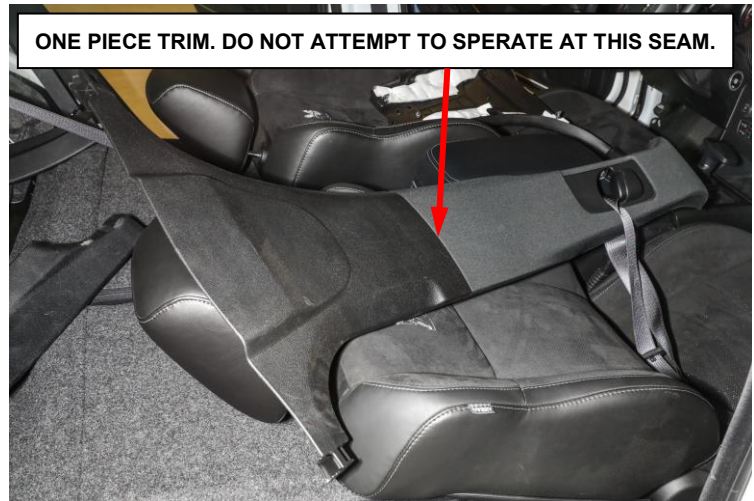
Figure 1 – B-Pillar Trim

NOTE: In headliner procedure, remove both upper and lower C-Pillar trim panels.