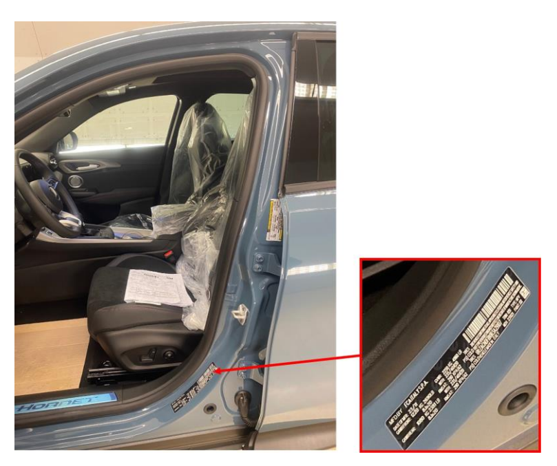
Figure 1 – Locate Manufacturer Label Location

1. Locate the manufacturer label on the vehicle driver side B-pillar (Figure 1).