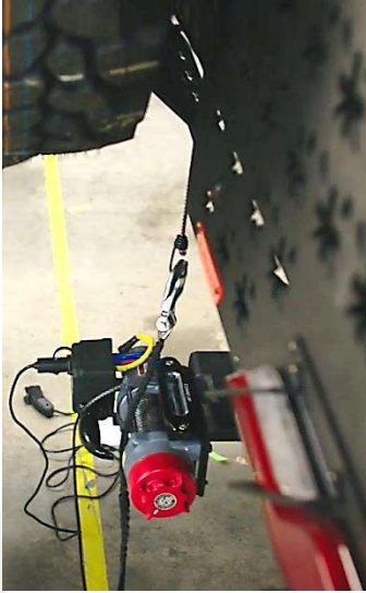
Figure 5a Attach bungee cord to winch hook