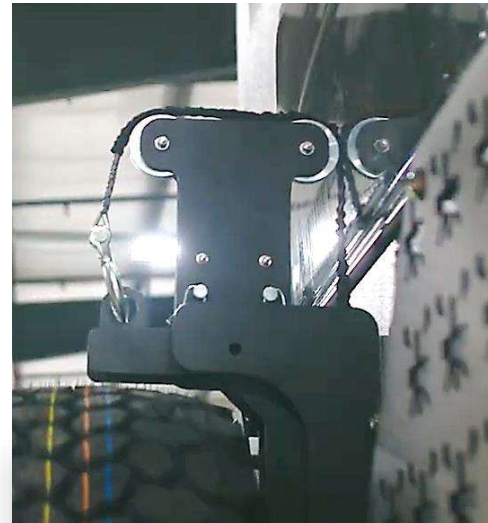
Figure 5c Route winch rope over pulleys and attach to spare tire holder eyelet