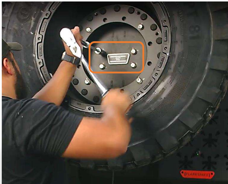
Figure 6 Attach rear winch to hitch adapter tube