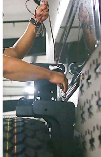
Figure 5b Pull winch rope to top of spare tire carrier