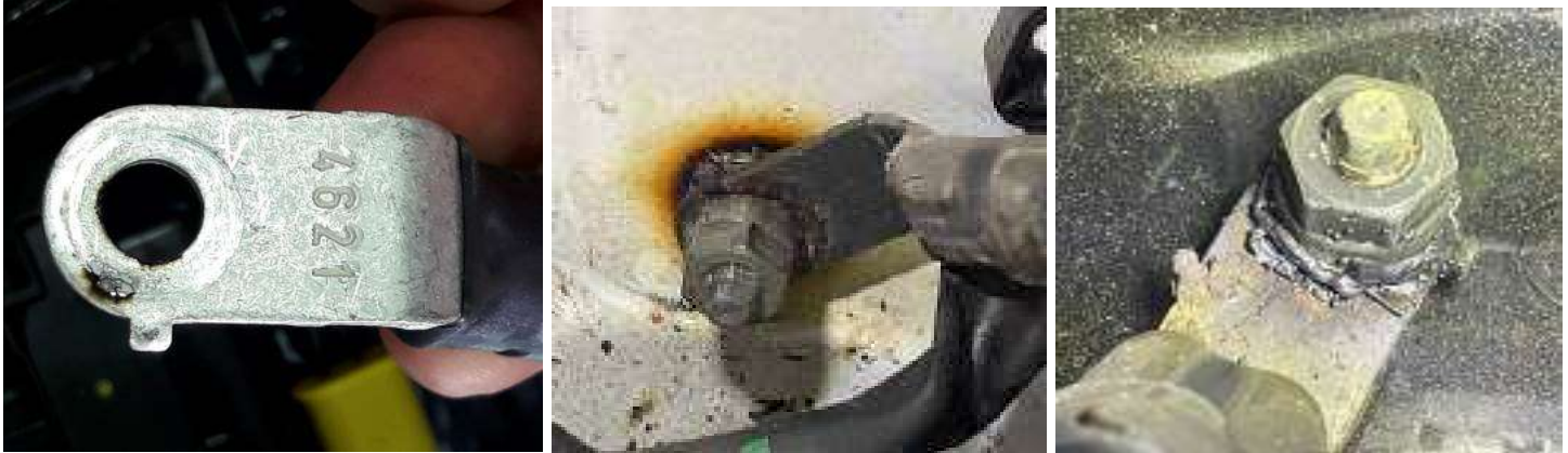
Figure 3, examples of thermal damage (e.g. evidence of arcing, scorch marks, welding of the nut/cable lug/bolt), not OK pictures

Nm Torque ground line to ground bolt 16 Nm .