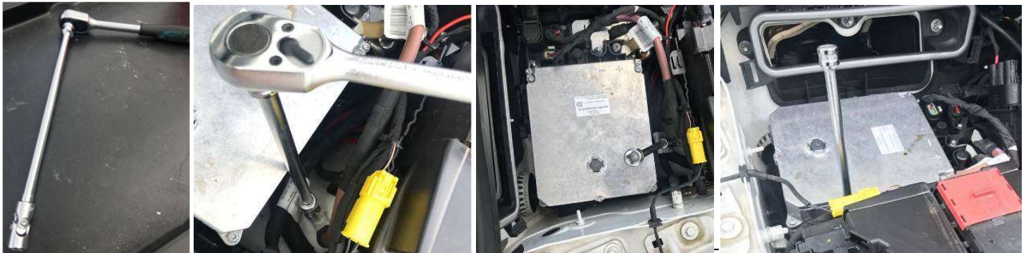
Figure 2, Accessibility of ground screw connection of 48 V battery (W106/3)