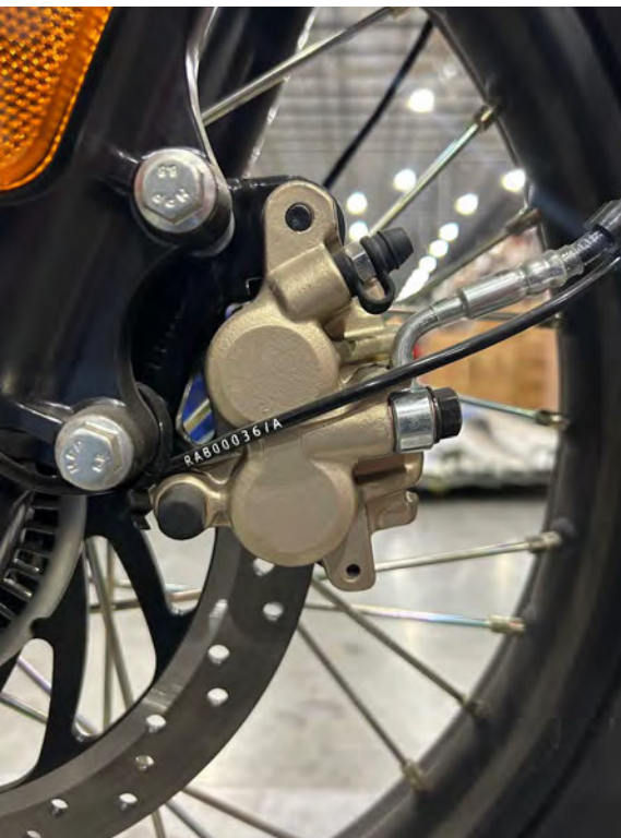
Non-Anodized Rear Non-Anodized Front