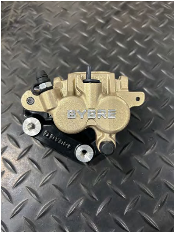
Anodized Rear Anodized Front

Royal Enfield North America Limited www.royalenfield.com/USA 226 North Water Street Milwaukee, WI 53202