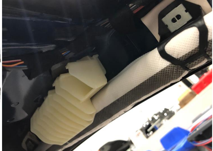
Figure 2 (Installed absorber on the left side)