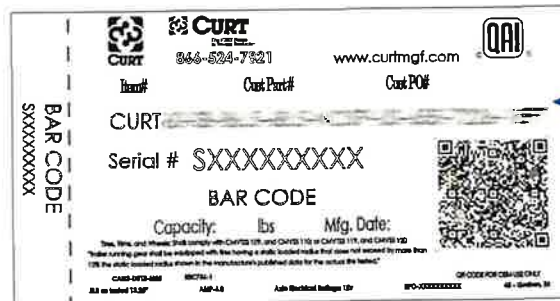
Axle Tag Sample (Not an exact replica)

A clear photo of the axle tag, including the axle serial number, must be submitted once inspection or repair is completed.