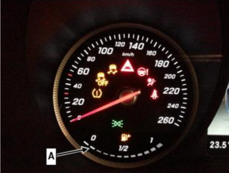
Figure 1 (shown on model 205)