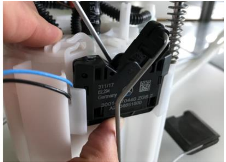
Figure 4 (using a screwdriver, carefully push float-and-lever sensor housing away from module housing and at the same time push float-and-lever sensor housing upwards.)