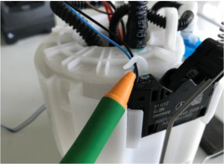
Figure 3 (remove lines from routing clip)