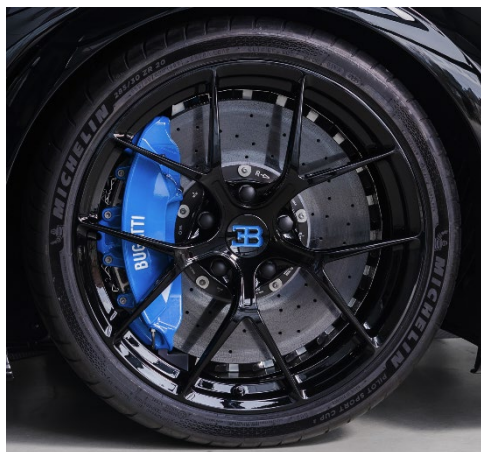
Chiron Sport Wheel design overview

!!! Each concerned vehicle must have a new set of wheels !!!