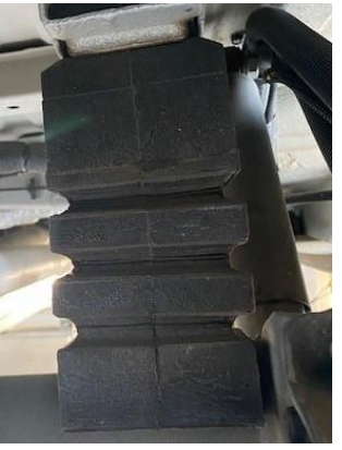
Front Stock Spring