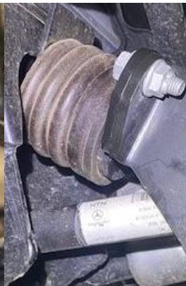
Front Upgraded Spring