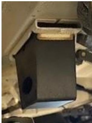
Rear Stock Spring