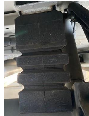
Rear Upgraded Spring