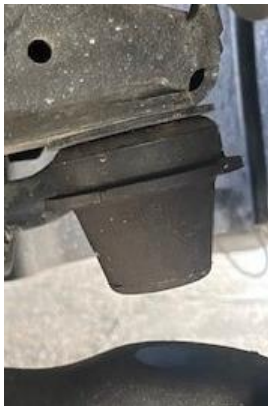
Front Stock Spring