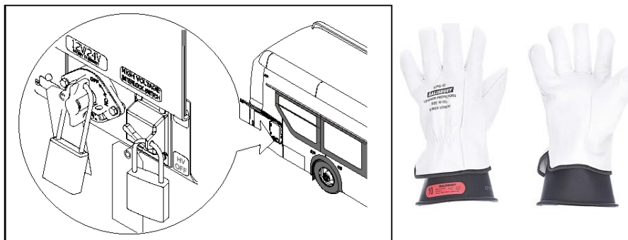
Figure 1: HV and LV Disconnect Switch Location and Arc Flash Glove Reference

🔧 NOTE: Use commercially available lock out equipment and tags being sure to follow any local laws or workplace procedures.