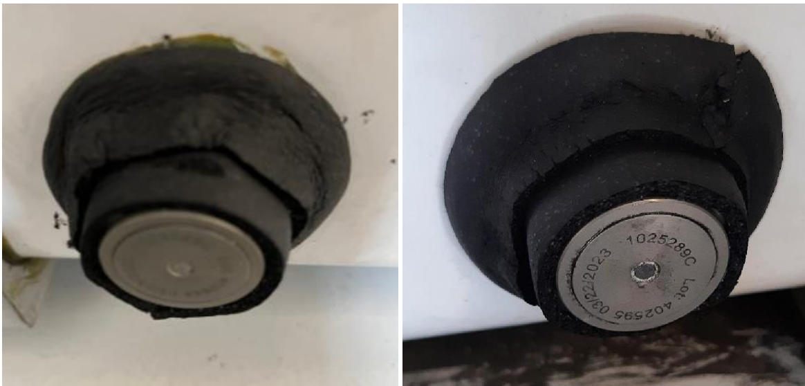
Figure 3: ESS Drains Insulated with 8” Strips of Armacell R-1 Foam Tape

WARNING: Avoid covering the piston when applying the foam tape!!! Tape is difficult to adjust once bonded!!!