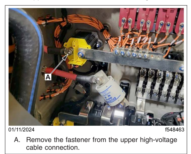
Fig. 1, High-Voltage Junction Box (inside view)