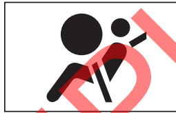
(Ejemplo – Luz de advertencia del SRS)