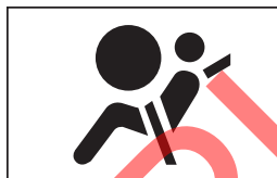
(Example – SRS Warning Light)