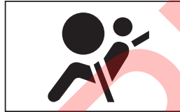
(Example - SRS Warning Light)