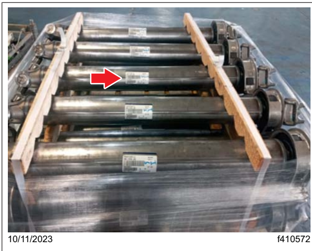
Fig. 2, Location of the Driveshaft Label