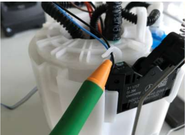
Figure 3 (remove lines from routing clip)