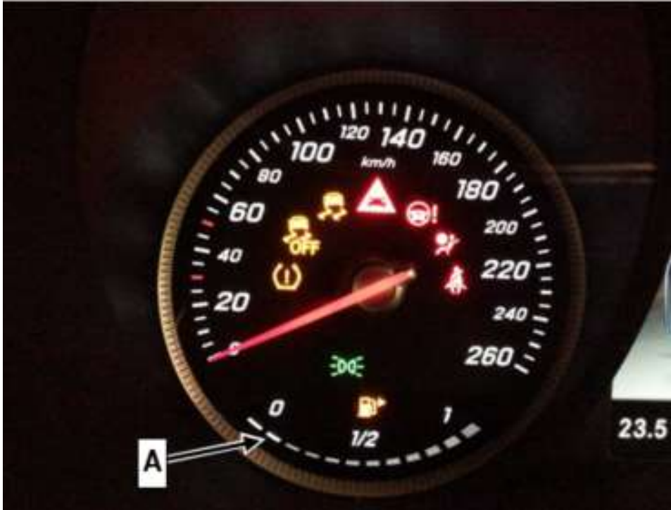
Figure 1 (shown on model 205)

i This corresponds to two lines (A) on the fuel display ( Figure 1 ).