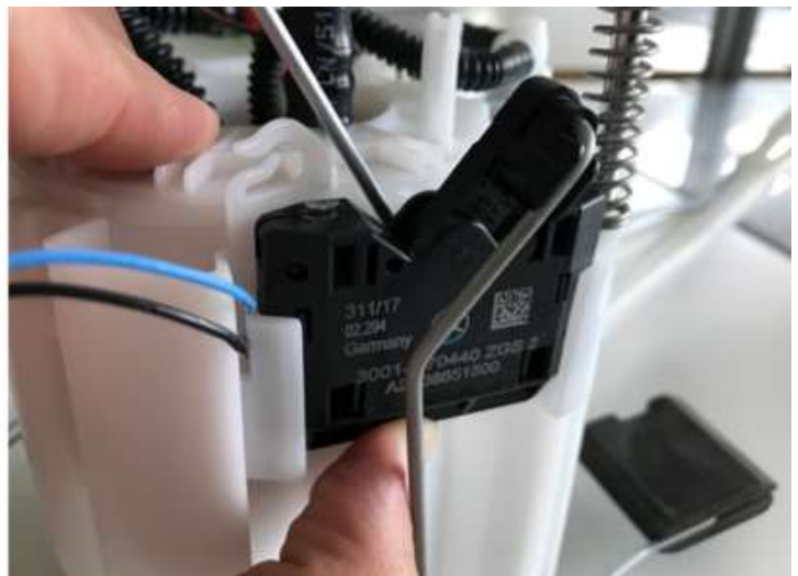
Figure 4 (using a screwdriver, carefully push float-and-lever sensor housing away from module housing and at the same time push float-and-lever sensor housing upwards.)