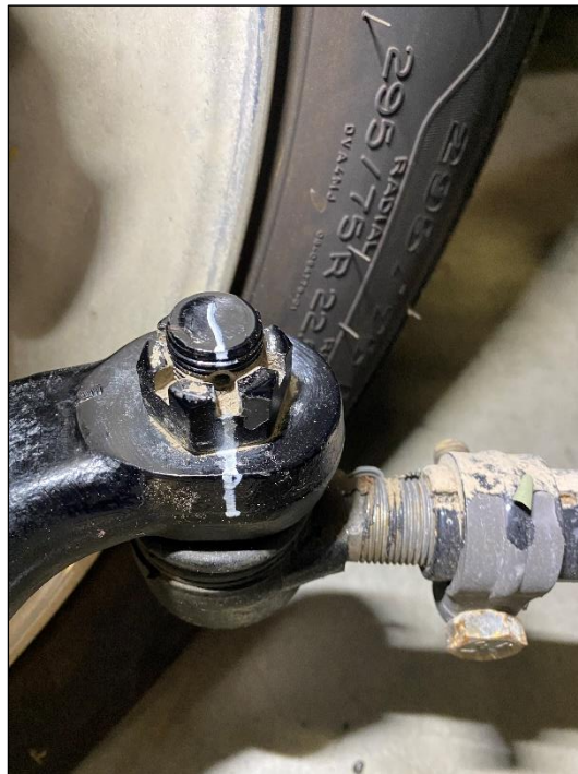
Fig. 4, Tie Rod Bolt, Castle Nut, and Tie Rod Arm Marked