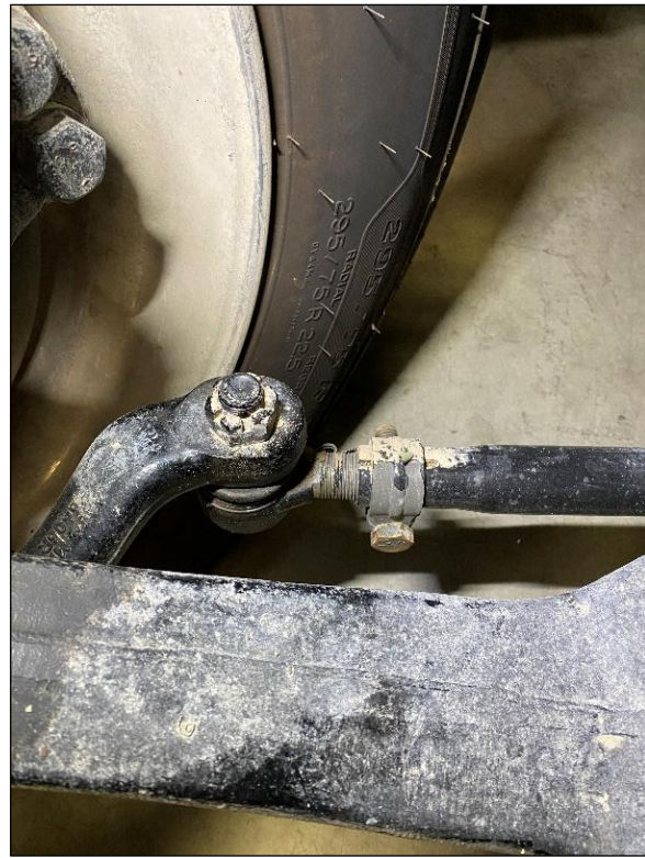
Fig. 3, Cotter Pin Removed