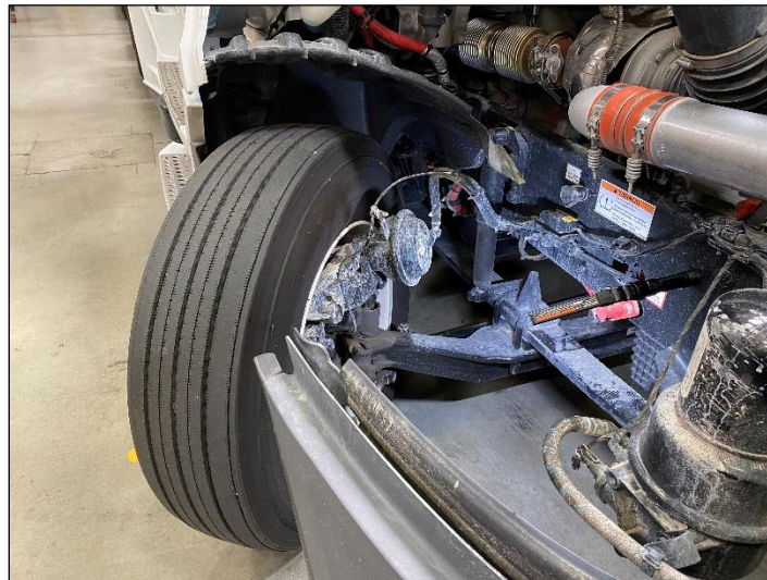
Fig. 1, Hood Opened and Wheel Turned Full Right