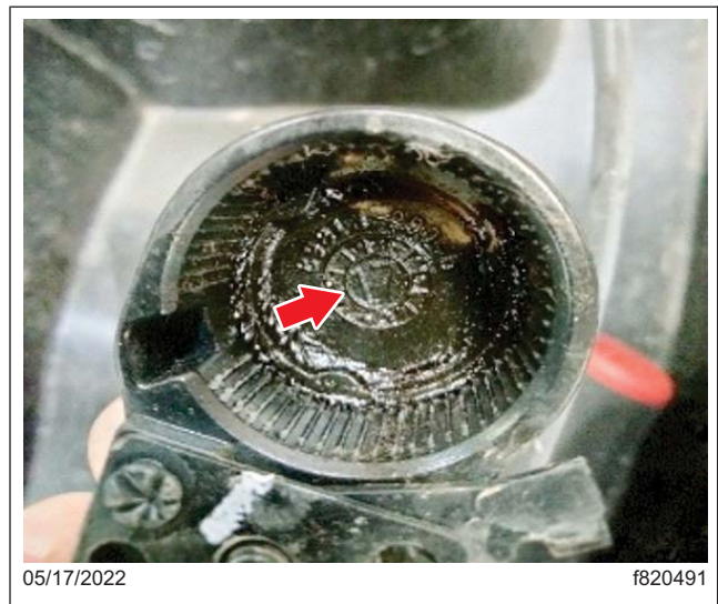
Fig. 2, Date Stamping on the Wiper Arm