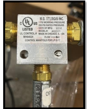
Figure 1: LP Manifold