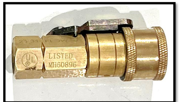
Figure 3: Enerco / Flextech Quick Disconnect