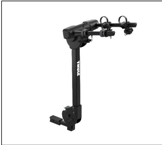
Thule Camber 2 bike 905800