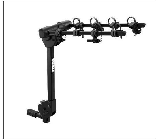
Thule Camber 4 bike 905600