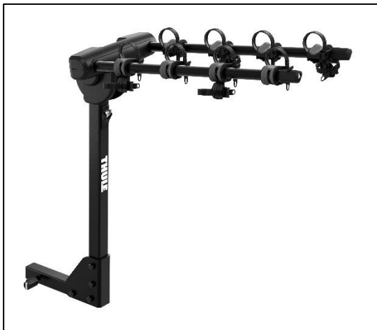
Thule Range 4 bike 905700