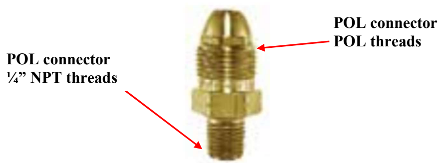
Figure 3: POL Connector for Air Test